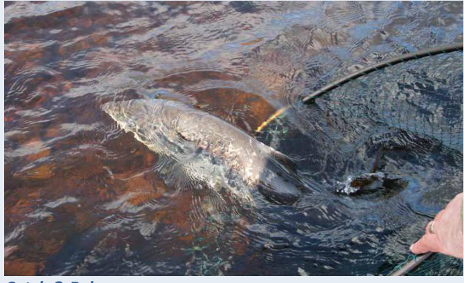
Catch & Release

(Catch and release is largely voluntary in Scotland)