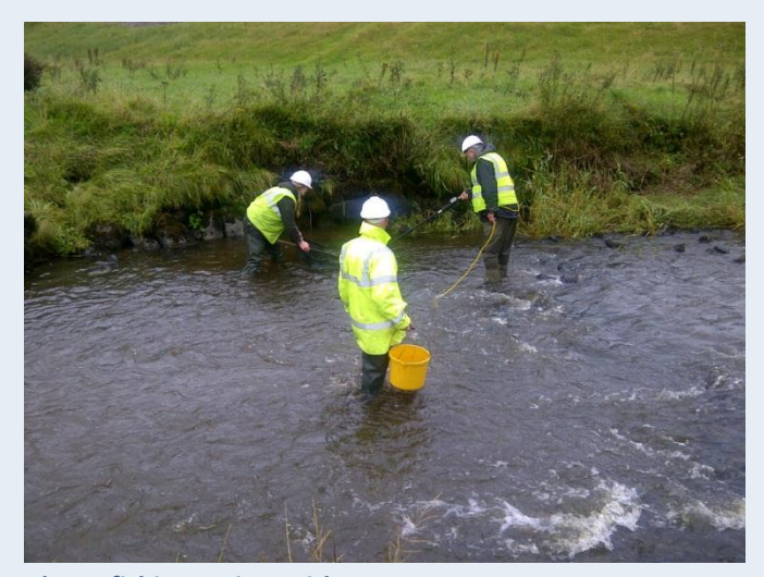
Electrofishing - River Nith

Fisheries management decisions should be taken according to the best available science and evidence. Fisheries Trusts play a key role in the scientific monitoring of the freshwater environment and fish populations. The programme of electro-fishing undertaken by Trusts and DSFBs is the largest in Scotland.