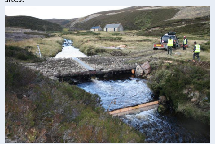
Improved fish passage on the River Don

Easement of Barriers : Barriers to fish migration are a significant problem in many Scottish rivers. RAFTS is working to assess and prioritise barriers to ensure that the most significant obstacles from a wild fish perspective can be eased or removed. The WFD Restoration Fund can support this work at important sites.