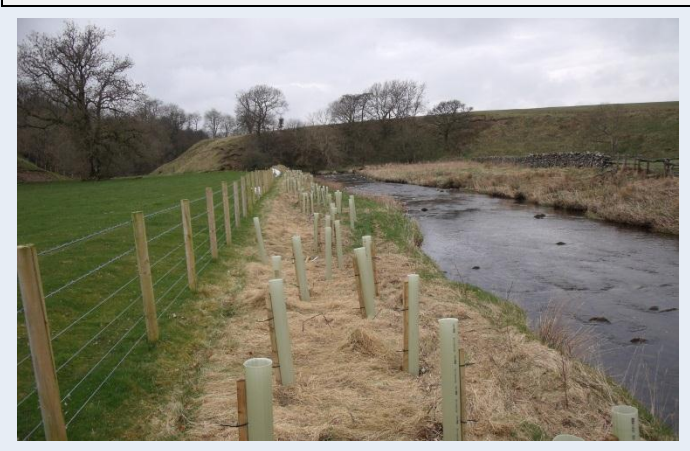
Riparian tree planting and fencing – River Annan

£155k: Investment in habitat restoration schemes