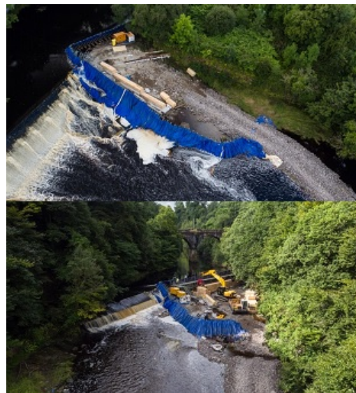
Image: September 2016 – Millheugh works (top) and Fernegair (bottom).

The partnership project between SEPA, the River and Fisheries Trusts of Scotland , Clyde River Foundation , Avon Angling Club and the landowners was funded by WEF (£1.2M).