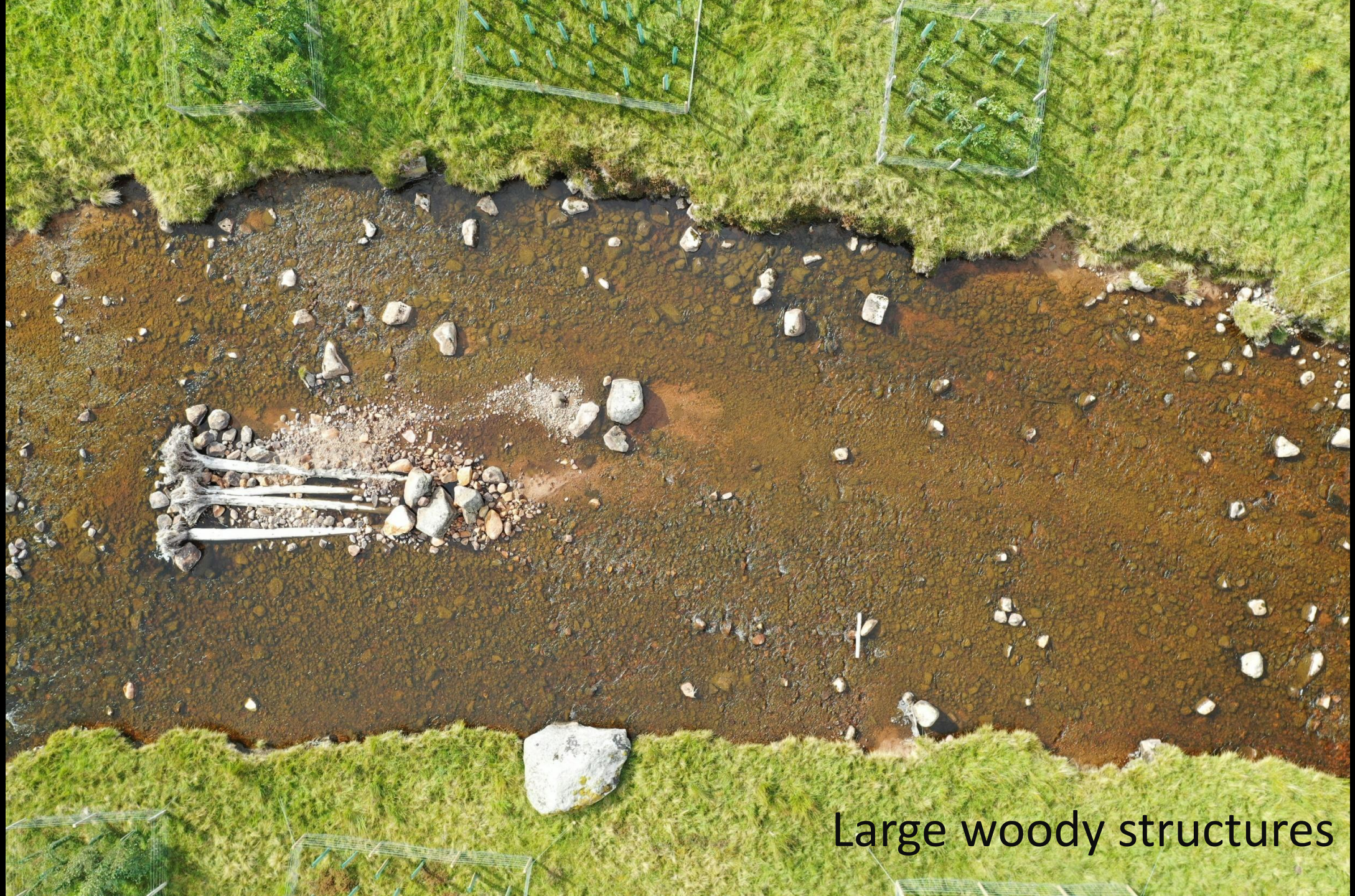
Large woody structures