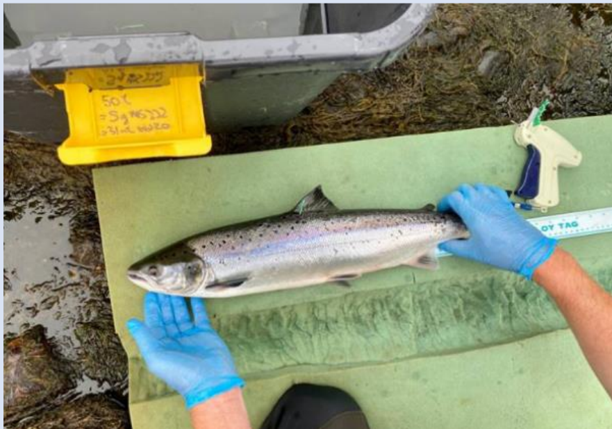
Adult salmon tagged as part of ASSESS