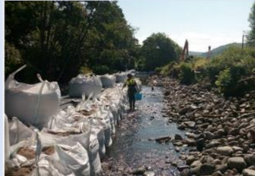
Numerous Fish rescues across the area