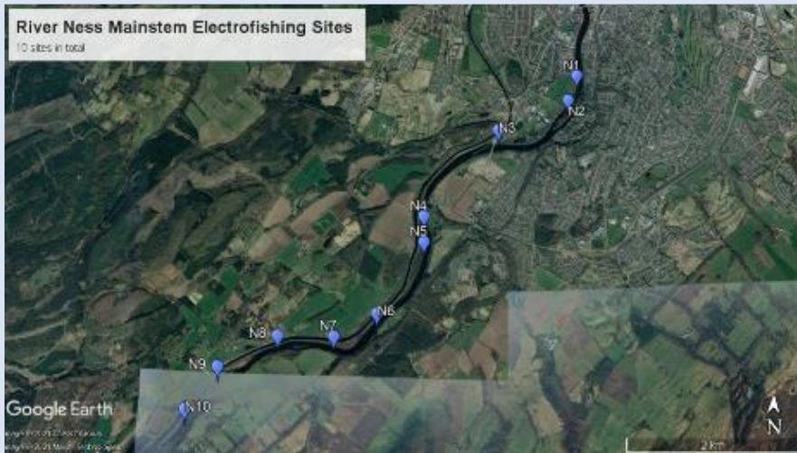
10 mainstem plus 30 NEPS Sites