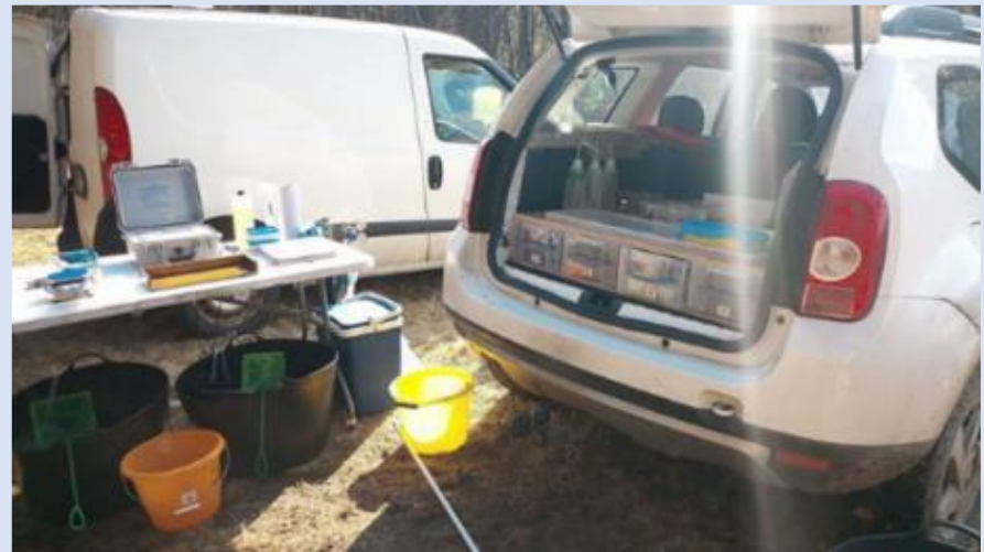
120 Smolts tagged as part of MFTP